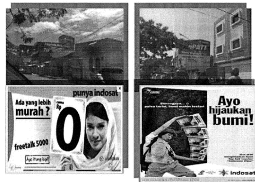
Figure 1. Example of the Cell Ads

I than, separate the phrase and the diction that used in cell ads. This is to find out the illustration in drawings and show the product in use with the brand name that strengthens the concept of cell ads. There are of course some pictures or visual message of this ads that shows such as:As a body copy analysis of the configuration dynamic in a cell ads is made by examining two elements of discourse,